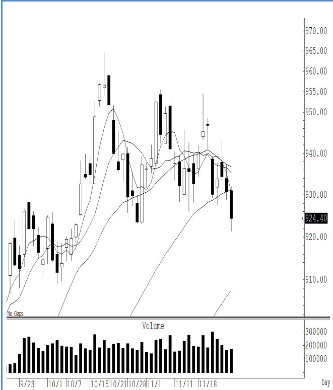
S50Z24 (Close 924.40 Chg -6.40)